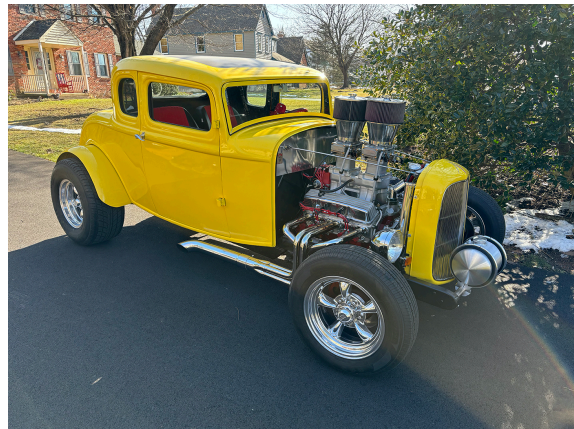
Road Angels Members Jim Serafine's 1932 Ford Coupe