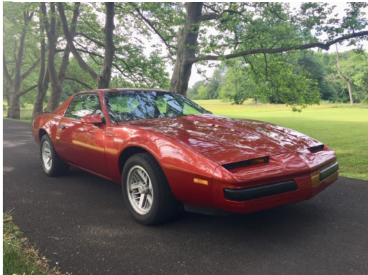
Road Angels Members Brad Sanders' 1988 Firebird

"We will be looking forward to meeting you!"