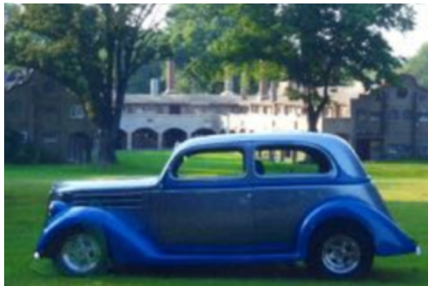
Road Angels Members Rich Tatar's 1936 Ford Sedan

"We will be looking forward to meeting you!"